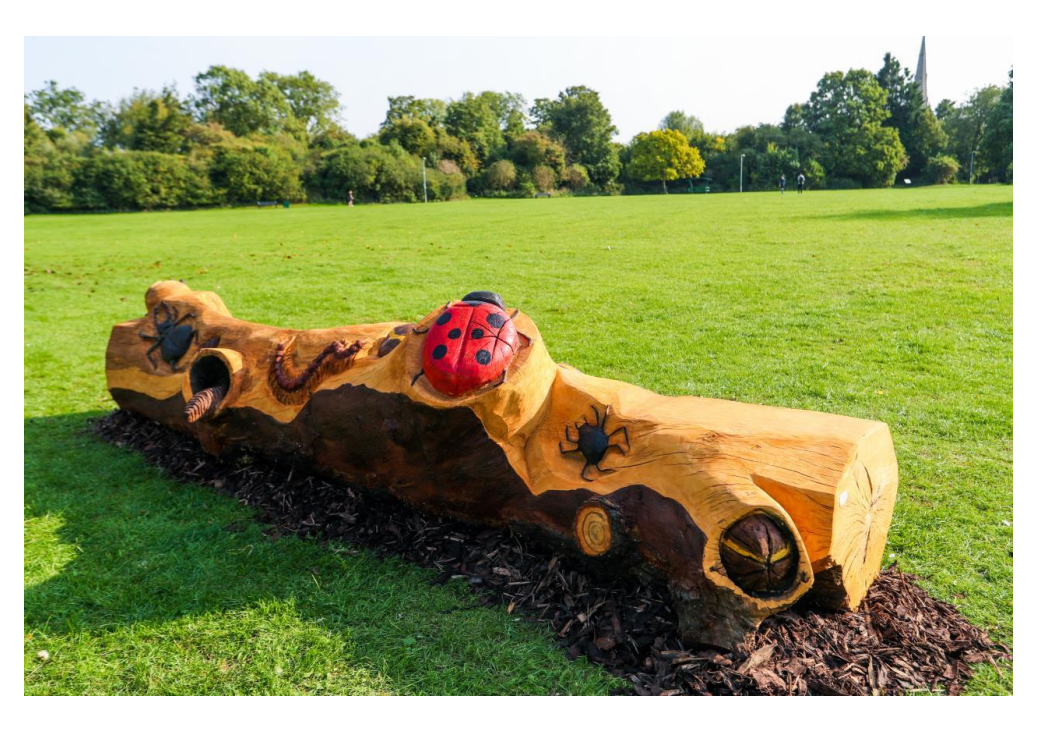
Caption: Creepy crawlies adorn the back of this bench which is now in position at Castle Fields. For hi-res image <u>click</u> <u>here</u>

"I encourage you to come and view the true beauty and artwork of the benches for yourselves; I have no doubt you will be as thrilled and impressed with them as I am."